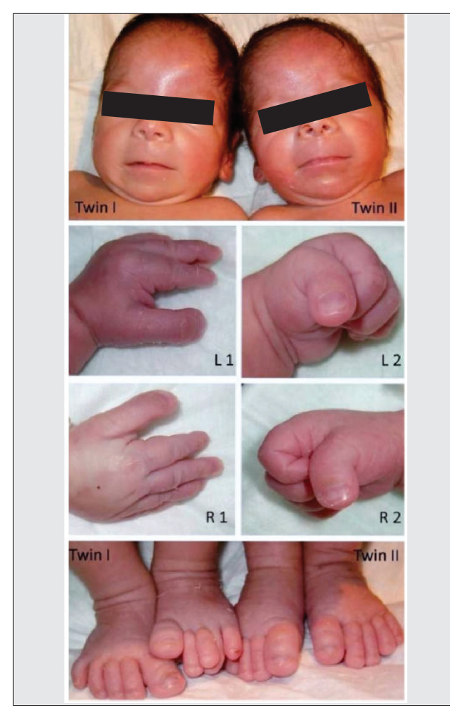
Figure 1. The appearance of the face, the broad, short thumbs and large toes are characteristic features of the Rubinstein-Taybi syndrome. The second twin had angulation of the distal interphalangeal joints of the thumbs. (L1-R1 and L2-R2 designate the left and right hands of first and second twins, respectively)

Twin sisters, aged 16 hours, were admitted to our Neonatology Unit due to respiratory distress. The twins were born by caesarean section at 35 weeks of gestation. They were the third and fourth children of healthy 32-year-old mother and 34-year-old father. There was no consanguinity between the parents. The mother had received adequate